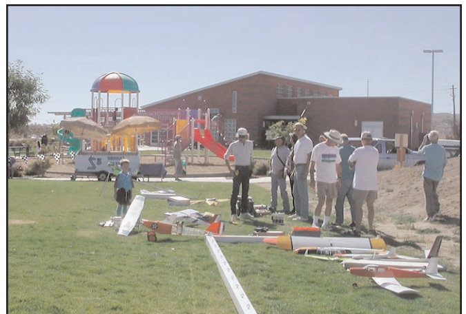
Some of the planes and participants of the Jr. Air Races.

The event isn't really a race at all, just a bunch of guys flying RC planes. The Reno RC club was there flying IC planes, and there were some control line pilots flying at the end of the grass field we were at.