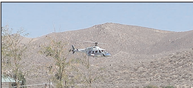
A very nice looking IC powered Heli, that was flown very nicely at the Jr. Air Races. I didn't get the pilot's name.