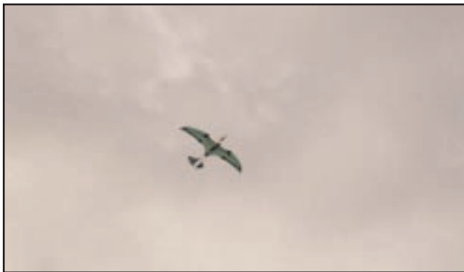
Pterodactyl in flight