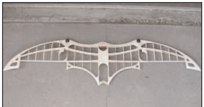
Wing bones with the revised wing tips to eliminate aileron flutter

The first flight was not a total disaster, but there were problems. The picture above was taken by Gordon right before it went into the air for the first time. I could barely control it in the air and was able to land it immediately without damage. It was back to trial and error! It turned out to need about one degree more positive wing incidence and the CG needed to come forward about one inch. On its second test flight I stripped a wing servo due to a nasty aileron flutter. I put in bigger servos and gap sealed the bottom of the ailerons, but it still fluttered on its 3th flight. I revised the wing by replacing the ailerons with shorter ones and adding fixed wing tips. I also sheeted part of the leading edge and gusseted some weaker points. (See picture below)