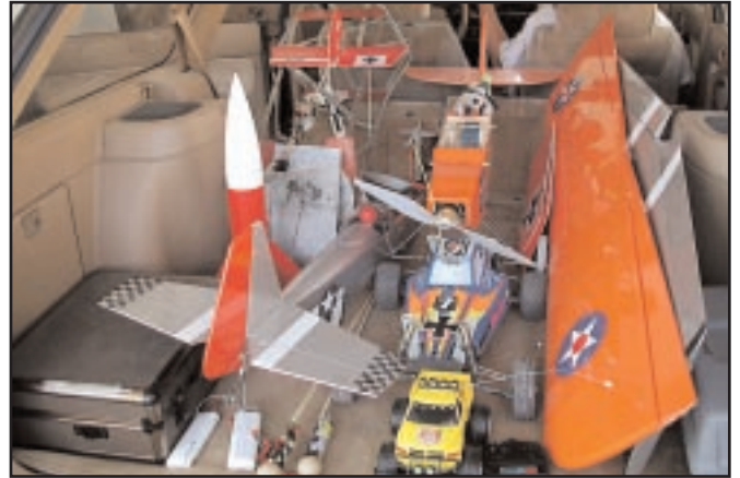
Back of my station wagon with 3 RC cars, 4 RC planes, 4 model rockets, and a bunch of big illegal fireworks.

On a recent trip to the Stagecoach dry lake, this is what the back of my station wagon looked like. We went in the evening, arriving on the playa at 6:45 pm. It was cool, there was no wind and the sunset was beautiful. We played with toys till 10:00, then packed it up and promptly got lost trying to find a road out. Then my all wheel drive wagon got high centered on a pile of dirt. Despite all that, my son, brother and I had a great time. I highly recommend the dry lake in the evening in the summer.