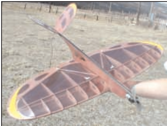
Ron Marston's scratch built low wing slowflyer: Speed 280G, 9.2 oz ready to fly