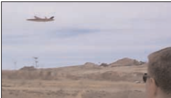
Low wing slowflyer in the air at Ranch San Rafael