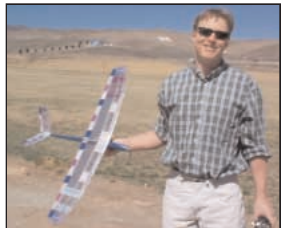
Stick an Astro 010 in a mini hand launch fuse (courtesy of Chris Adams), build a wing and tail out of $2.00 worth of balsa, and you have a sweet 10oz aerobatic motor glider. (This is version 2)