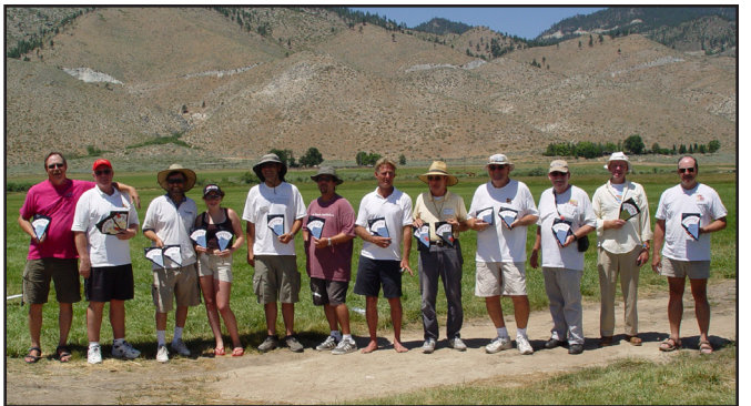
The winners of the 2005 Gamblers' Gala contest.