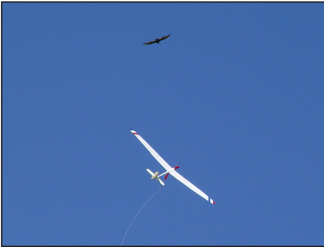
Ron Brown's Compulsion on the winch seems to veer away from a hawk

There's a nice picture of Ron Brown's Compulsion launching into a hawk's airspace (below). It looks like the plane is veering to the right to avoid the hawk. I'm not sure if the pilot was intentionally steering clear of the bird, or if the turn was due to the launch parameters of the plane still being fine tuned. In any case, it makes a good picture.