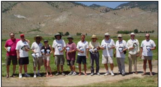
The winners of the 2005 Gamblers' Gala contest.