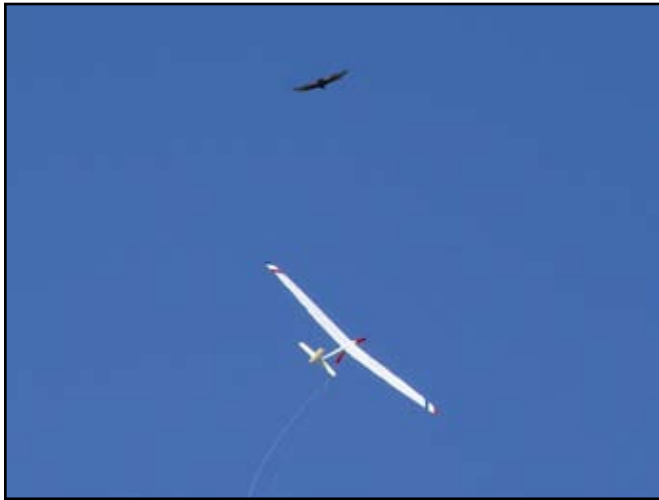
Ron Brown's Compulsion on the winch seems to veer away from a hawk

There's a nice picture of Ron Brown's Compulsion launching into a hawk's airspace (below). It looks like the plane is veering to the right to avoid the hawk. I'm not sure if the pilot was intentionally steering clear of the bird, or if the turn was due to the launch parameters of the plane still being fine tuned. In any case, it makes a good picture.