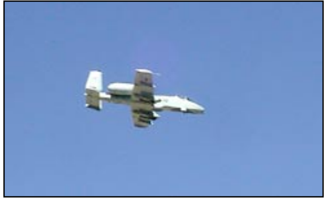
Is it a model or is it real? It's a real Warthog flying at the Reno Air Races.