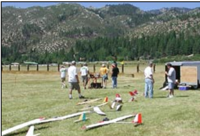
Pilots and planes at the August contest in Washoe Valley