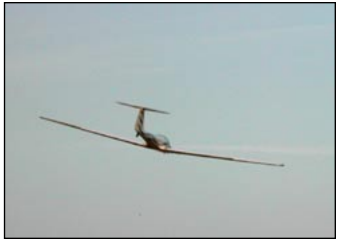
This is the full scale plane that buzzed the field Saturday morning.

Over the weekend I saw lots of nice planes and equipment, and lots of nice flying, both in the contest and after. Saturday and Sunday morning the field was buzzed a full scale plane that got down to about 40 feet on one pass, and actually did a touch and go on another, both with the motor off!