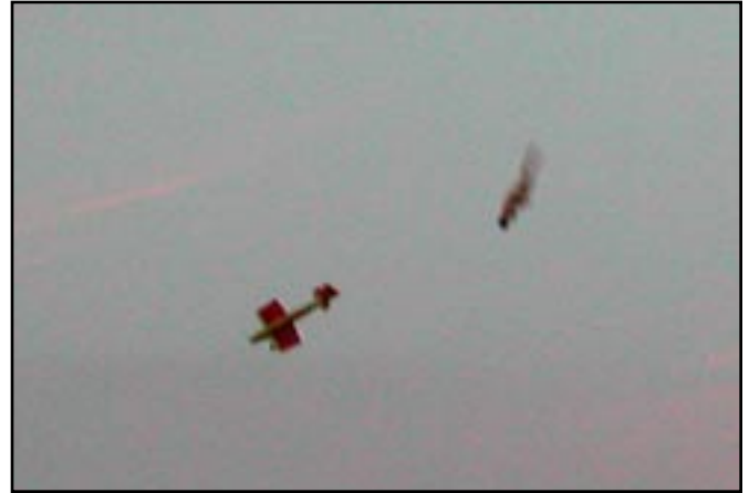
Kinda hard to tell, but this is a Hacker powered Diablotin towing a full scale female blow up doll. You see the coolest stuff in Visalia.