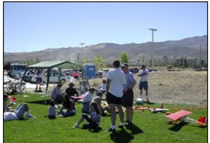
The Junior Air Races at the North Valleys Complex in Stead.