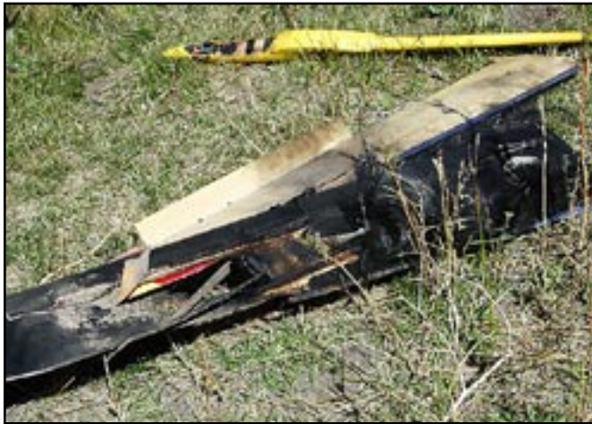
Adam's fried plane

The excitement for the day had to be when Adam flew a little too close to the power lines on the North side of the field, and used his wing to bridge two of the high voltage lines. Carbon fiber is a conductor at high voltages; it also apparently has a lot of resistance, which generates a lot of heat, which catches planes on fire, and causes the carbon fiber to explode from the inside of the wing, and make lots of gray smoke.