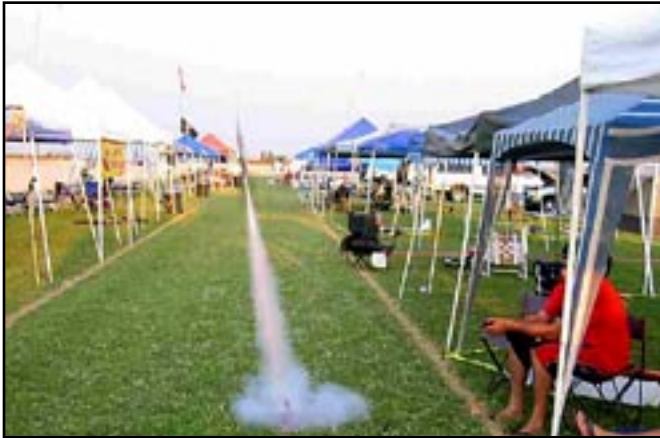
This guy was launching Rockets from his tent Friday night at Visalia.

with a vertical fin on the rear and a motor/prop with wheels on the front. They all flew nicely. Someone was launching rockets Friday night from his tent (below). This guy was also flying a parkflyer Sopwith Camel under the roof of the main covered area of the field.