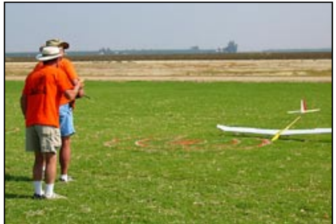
Lee Cox getting a landing at Visalia.

Lee Cox ended up scoring highest of the S3 crew, with a placing of 84th in Open class (out of 217 pilots registered).