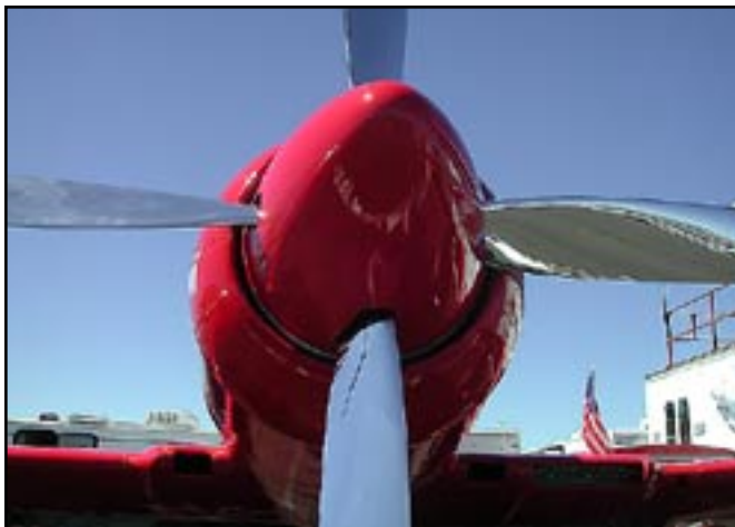
Check out the beautiful and huge prop/spinner on this Sea Fury, seen at the Reno Air Races.